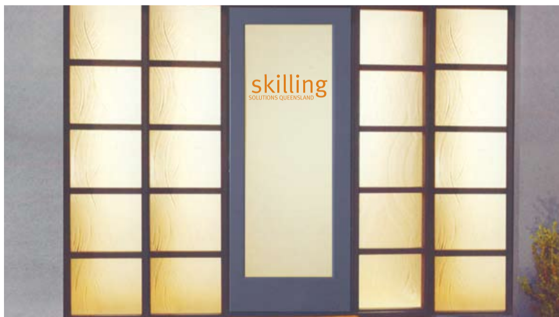
AND WE COME TO THE DOOR OF A SKILLING SOLUTIONS QUEENSLAND OFFICE.