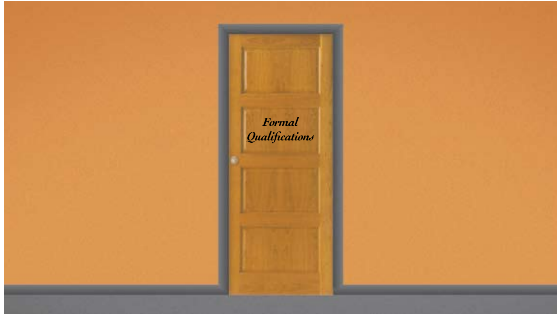
SUDDENLY WE PULL UP AS WE COME TO A DOOR THAT REMAINS CLOSED.