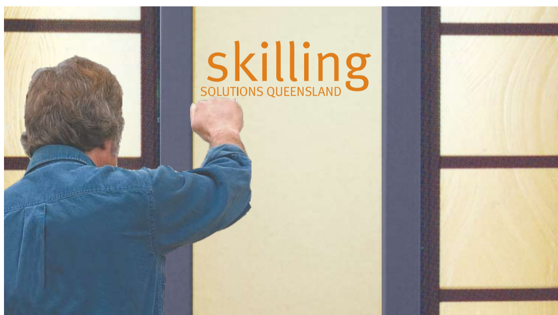
VO: Knock on our door.